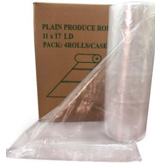
LDPE Paraffin Liner: