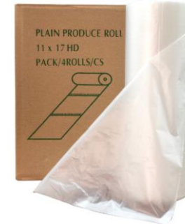
HDPE Paraffin Liner: