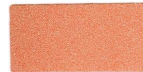
Mini Long Buffer: